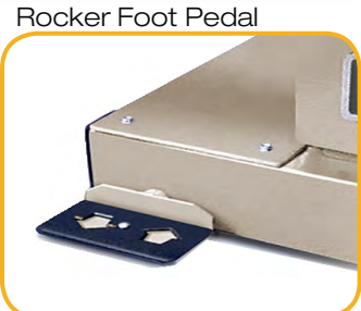
Mounted on both sides of the table base for easy height adjustment.