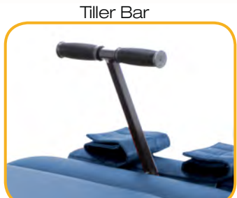
Inserts for using manual lateral movement or circumduction during a flexion treatment.