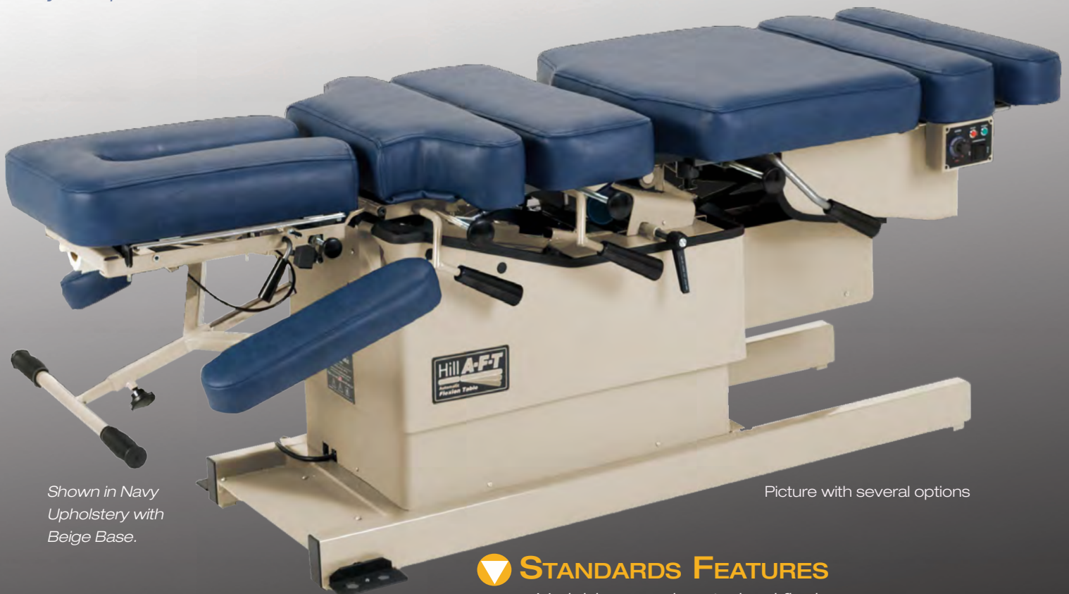
Shown in Navy Upholstery with Beige Base.

The Hill Automatic Flexion Table is perfect for doctors who want full-featured automatic flexion without the need for manual flexion. The AFT is surprisingly affordable for a table that features variable speed flexion, electric adjustable height and an impressive list of other standard features. Make the AFT even more versatile by adding up to four manual drops and several other options to customize the AFT for your specific needs.