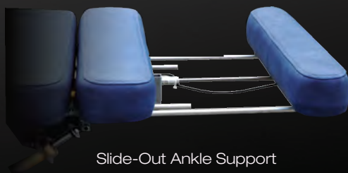
Slide-Out Ankle Support