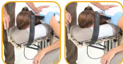
Flexion and rotation Headpiece