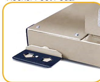
Rocker Foot Pedal

Mounted on both sides of the table base for easy height adjustment.