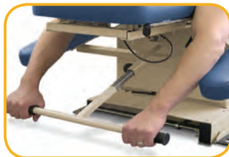
Patient Gripper Bar