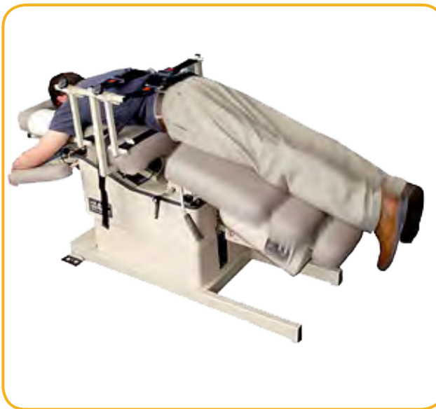
Hill AFT Scoliosis Treatment Package