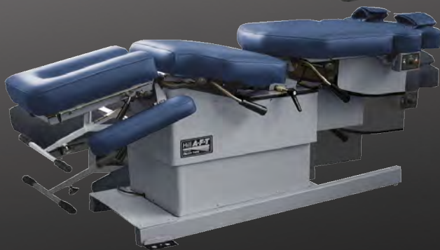
The AFT has adjustable height 21.5» to 29»